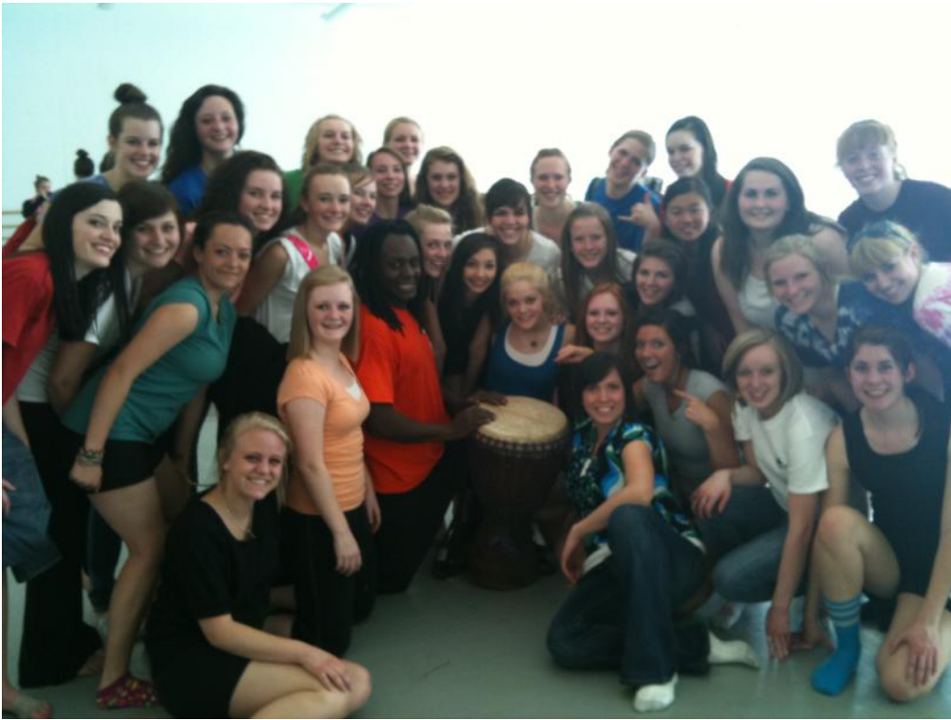
PHS Dance Company Enjoying their tour in New York City